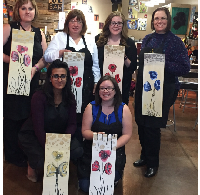
Participants in NNWLA art night at the Reno Art Bar!

wards Fall, we have several interesting and educational events planned, including a CLE on military law, a debate regarding the marijuana ballot initiative, and a CLE on Alternative Dispute Resolution.